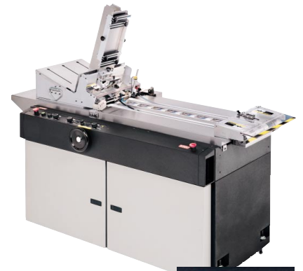
Cheshire® Model 7050 Ink Jet Base