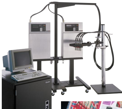
Cheshire® System 4000