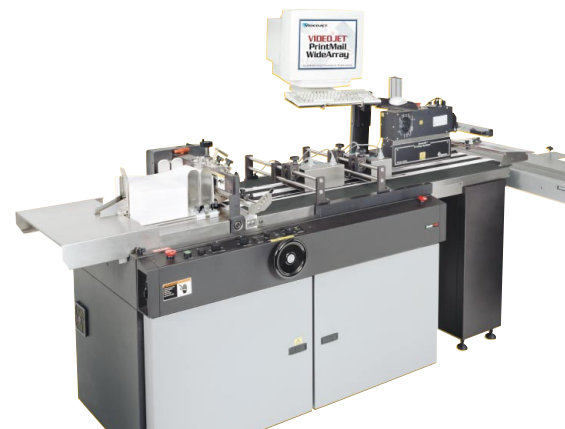
Videojet PrintMail™ WideArray System