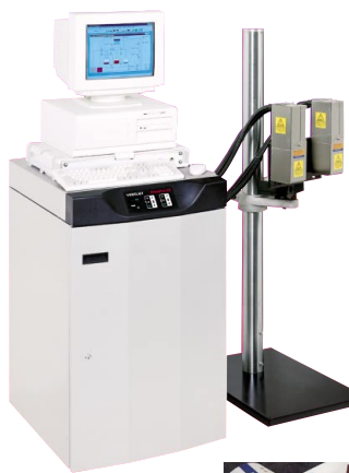
Videojet PrintPro™ System