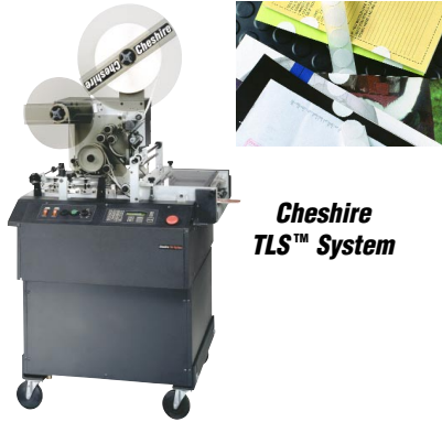
Cheshire TLS™ System